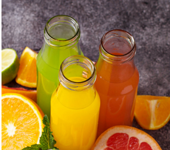
Single-Strength NFC Citrus Juices