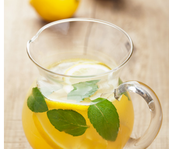
NFC Lemonades and Limeades