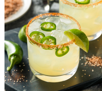
All-Natural NFC Citrus Blends and Bar Mixes