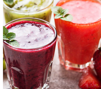
All-Natural Ready to Drink Smoothies