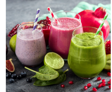
All-Natural Fruit Purees and Smoothie Bases