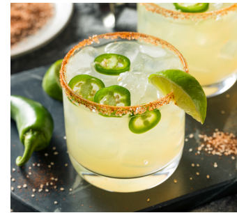
Premium Bar Mixes