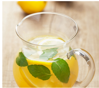
Not From Concentrate Fruit Ades