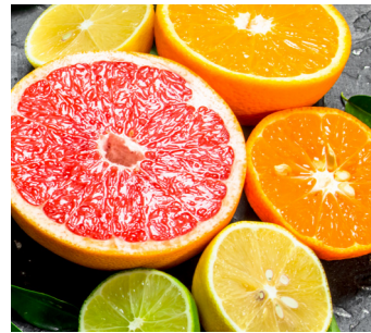
Not From Concentrate Citrus Ingredients