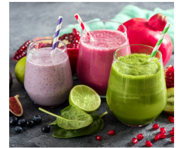
RTD Smoothies & Smoothie Bases