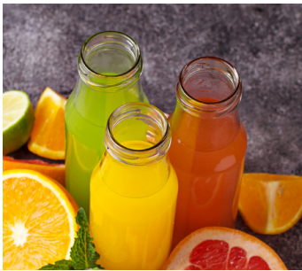
Not From Concentrate Citrus Juices

To inspire a world that believes in genuine beverages and ingredients.